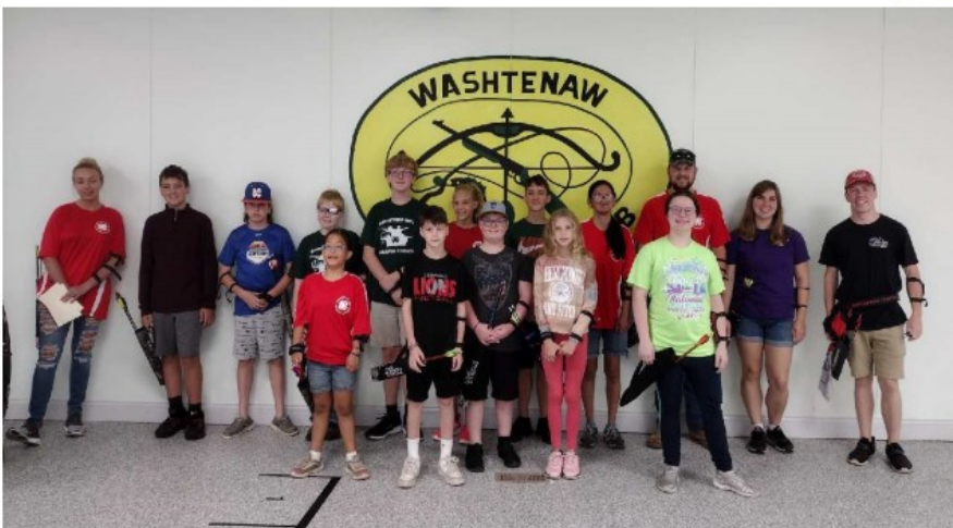
1 pm Line