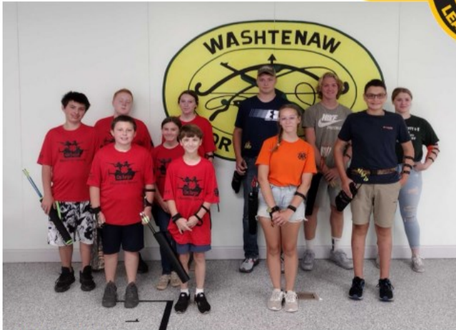
11 am Line